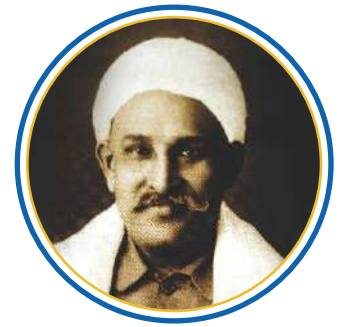
SETH ANANDRAM JAIPURIA IN WHOSE MEMORY THE SCHOOL WAS FOUNDED

A school full of happiness, Little One, is an experiential learning school that provides holistic education, emphasizes independence and ensures freedom within limits. The Play Way Method engages kids with a curriculum that is derived from the best of early childhood practices across the globe, making it age-appropriate, child-centered and child-responsive. A unique blend of education, care and values, Little One, nurtures multiple skills among the young minds to face the world.